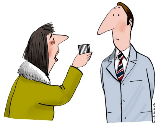
"HOW DO I HANG UP? I'VE BEEN ON A CALL TO INDIA FOR 3 DAYS."

A recent YouGov study* reported that 53% of the UK mobile population still own a standard or feature phone, and 42% of them expect to get a smartphone as their next mobile. They are relative latecomers to smartphones without the level of interest of early adopters or the early majority. The industry calls them Late Majority, but we think Accidental Majority best describes these users who have really just stumbled into smartphone ownership.